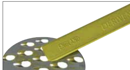
Grate 'n' Shake